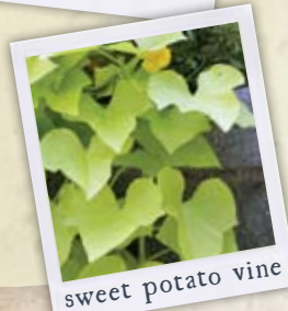
sweet potato vine